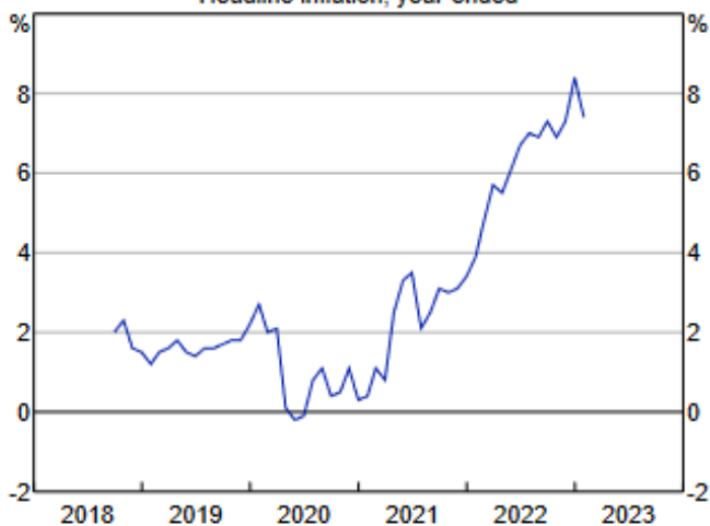
Monthly CPI Indicator Headline inflation, year-ended

Despite this, government bonds are still safe and secure. The government's sovereignty backs the income stream. It is easily traded in the money market and considered as good as liquid cash for banks, with regulators requiring significant exposure to these instruments as part of the credit creation function performed by banking institutions. For example, every dollar held in bonds, allows four dollars to be lent to borrowers.